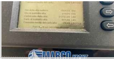
Riviera 42 fly